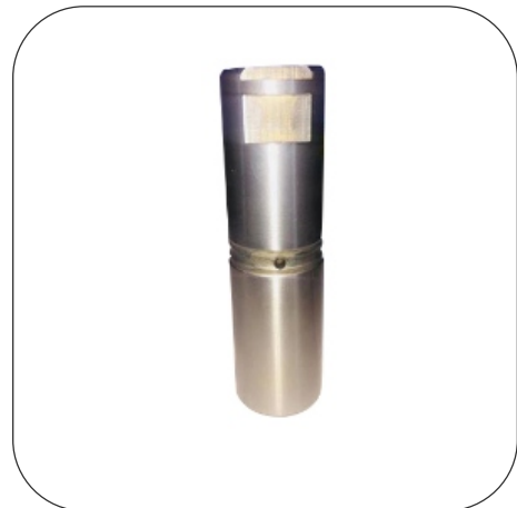
SPRING PIN & BELLCRANK PIN