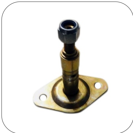
PATTI TYPE SPRING PIN