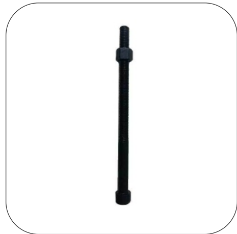
HCV CENTRE BOLT