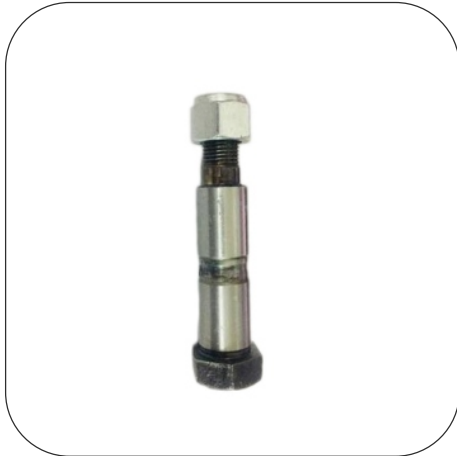
SPRING PIN UTILITY PICKUP