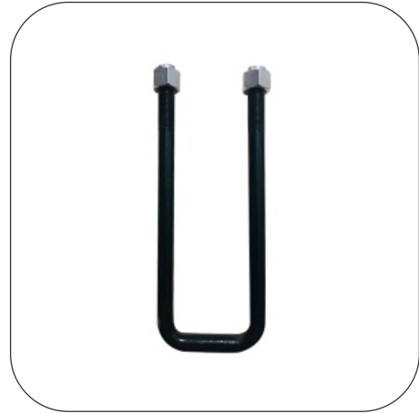
LCV HEAVY DUTY U BOLT