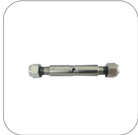
SHACKLE PIN TATA ACE