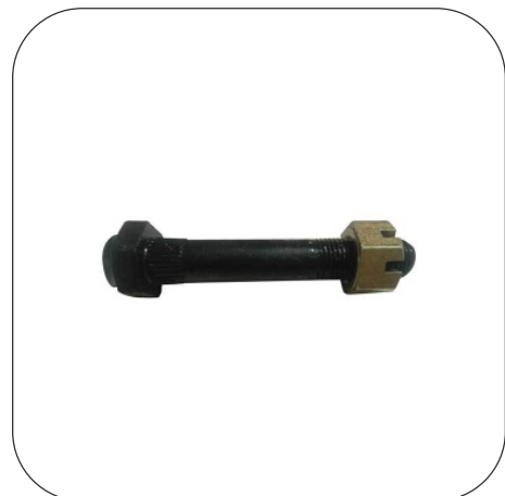
SPRING PIN JEEP